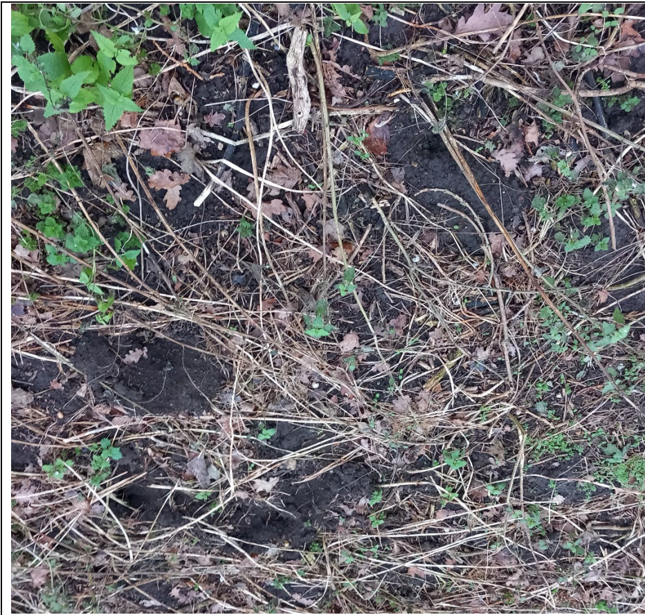
20% or more of woodland area has damaged ground, combination of deer, badger and rabbit.